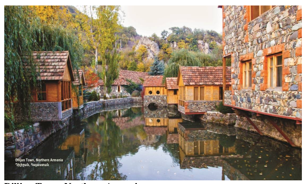
Dilijan Town, Northern Armenia