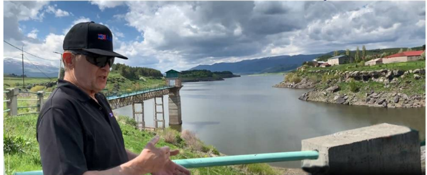
INDOOR AANSI TRAINING SITE, ARMENIA