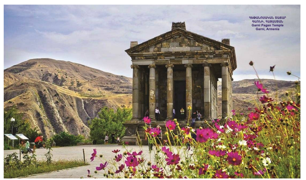
Garni Temple, Armenia