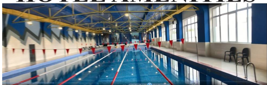
Olympic-size swimming pool