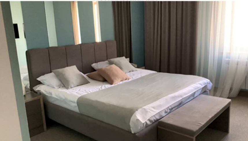
Great Comfort and world-class

If you are not trained and need training, don't worry, the AANSI Team of expert trainers will provide you with cutting-edge training in Armenia from August 5 through 12, 2023 in any of the fields of your choosing that are critically important in times of national emergencies in Armenia.