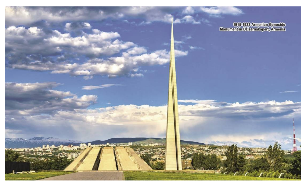
Armenian Genocide Monument & Museum, Armenia