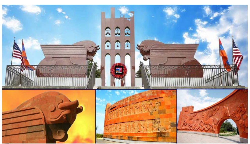
Sardarapat Memorial Complex