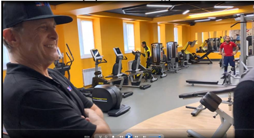
State-of-the-art exercise facility