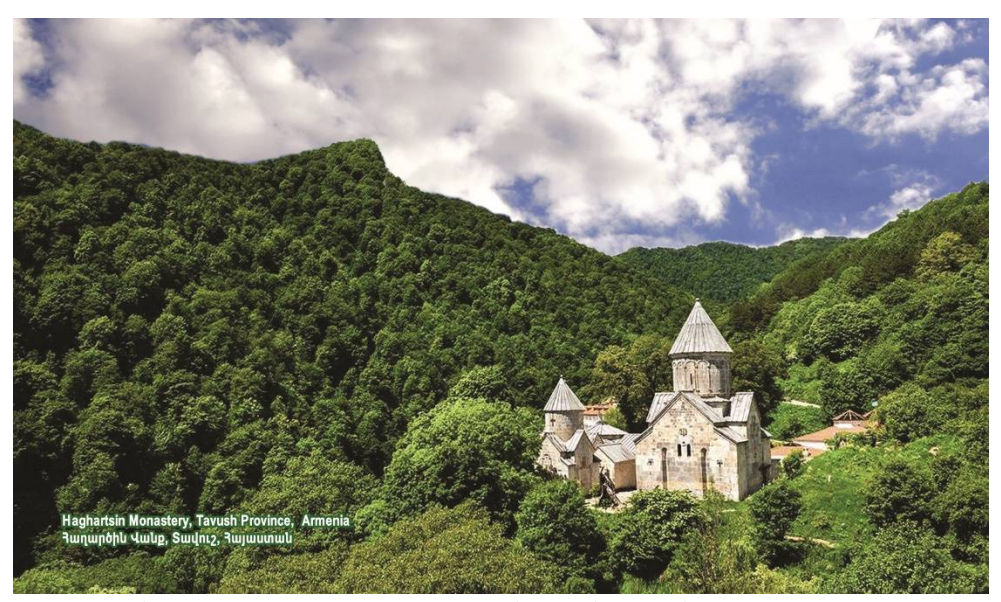
Haghartsin Monastery, Tavush Province, Armenia