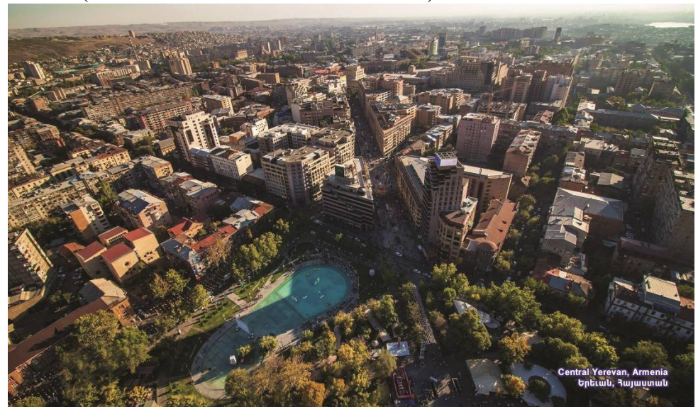
Central Yerevan, Armenia

CULTURAL TOURS (Total number of cultural site visits: TBD)