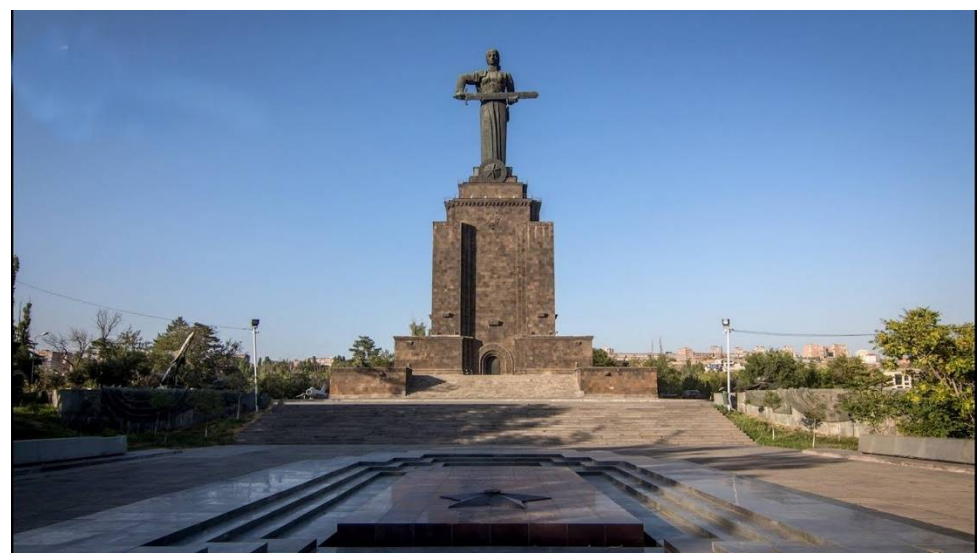
Mother Armenia Statue and Armenian Military Museum